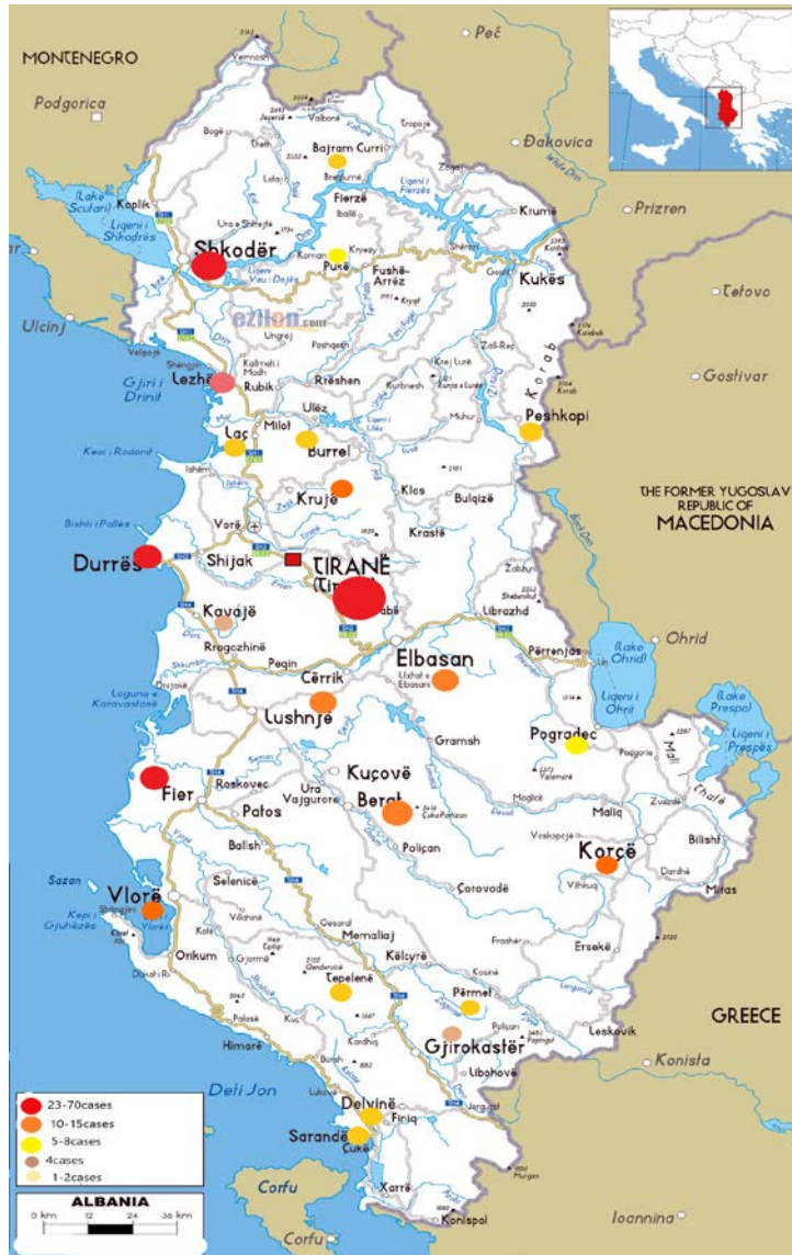
Figure 1. Map of positivity cases by the city

E-Mail of presenting author: abazajerjona@gmail.com