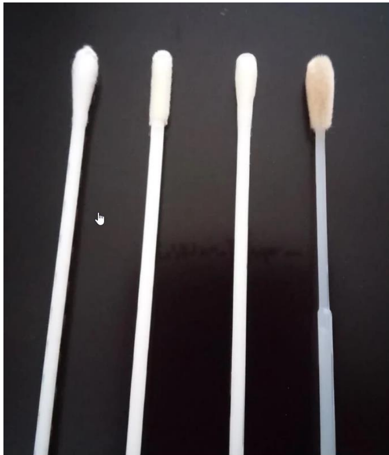
Swab types used in the study: A—dacron swab, B—polyurethane foam, C—rayon swab, D—flocced nylon swab