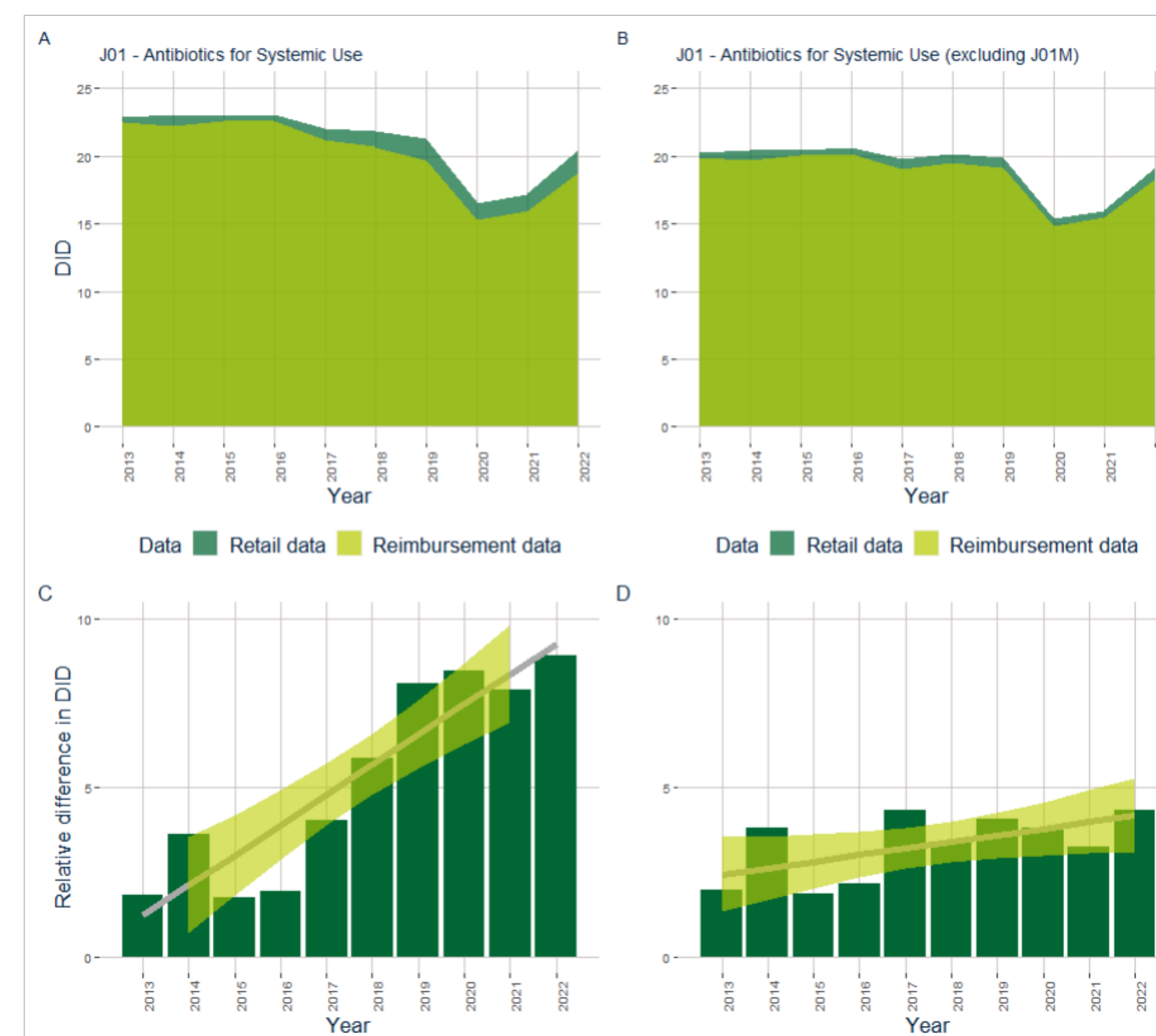
Figure 2. Evolution of outpatient J01 antibacterial consumption including and excluding fluoroquinolones (J01M) based on reimbursement and retail data (2013-2022)

Note: The difference between reimbursement and retail sales data (expressed in DID) is plotted against the average of reimbursement and retail consumption. The mean difference represents the systematic bias between the two metrics, and its 95% limits of agreement are shown.